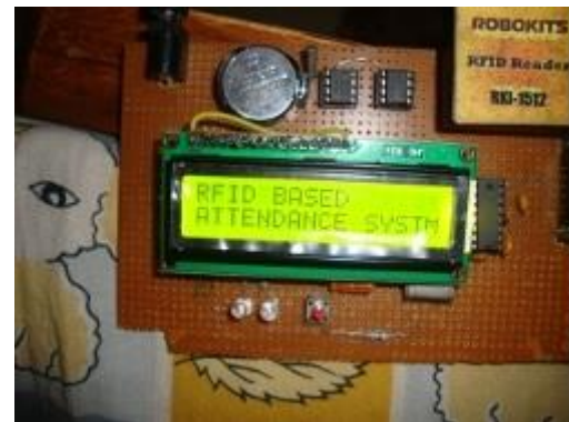
Figure 2: Default Screen

When 12 characters are transferred to controller, the controller matches the characters with the saved characters. If the characters are matched then controller sends '1' to green LED and time & date at time of entrance is fetched and stored.