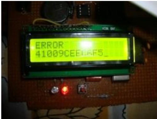
Figure 4: Invalid Entry