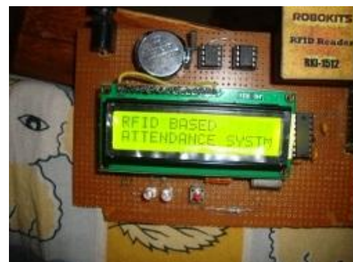
Figure 3: Valid Entry

When 12 characters are transferred to controller, the controller matches the characters with the saved characters. If the characters are matched then controller sends '1' to green LED and time & date at time of entrance is fetched and stored.