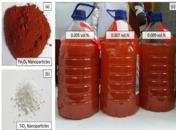
Figure 1: Schematic illustration of nanofluid preparation process