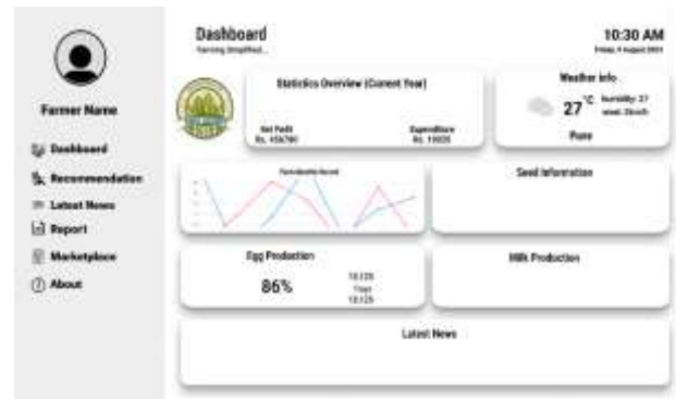
Figure 2: Dashboard

The main files of the project include react and python flask and the database which will have everything the user needs, also the user information will be stored in the database. The user’s information is stored in user table and the location of the user is fetched from the database for the weather module.