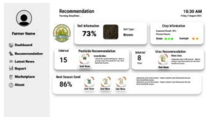
Figure 3: Recommendation

The output of the implemented model is shown here. The dashboard given in the screenshot below provides a detailed UI of the main page after the user logs in with his account. After the registration, all the user inserted data is sent to a database which stores the user information like name, city, agriculture land, etc.